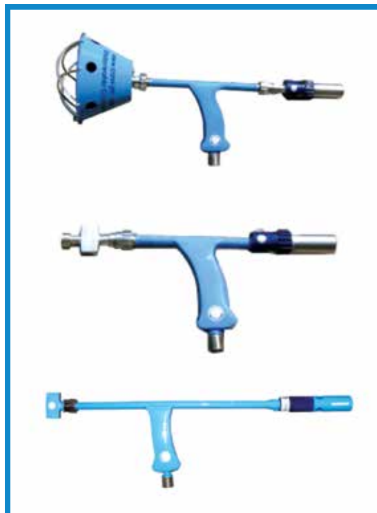
CAVI-JET UNDERWATER CLEANING GUNS