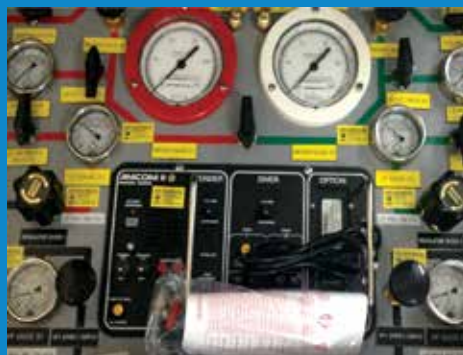
TOW DIVERS PORTABLE DIVING PANEL – DP001