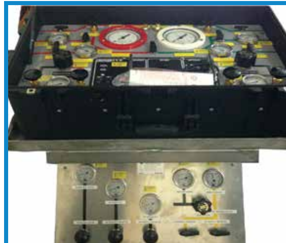
TOW DIVERS SURFACE SUPPLY DIVING UNITE – DP002