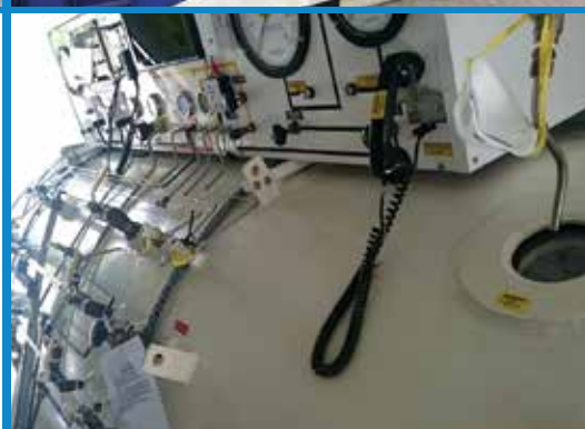
DINING DECOMPRESSION CHAMBER - DDC001