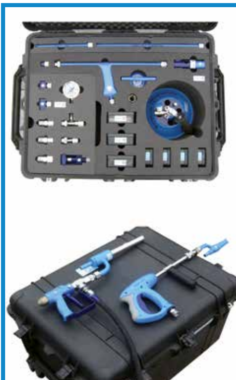
CAVI-JET SET FOR UNDERWATER CLEANING