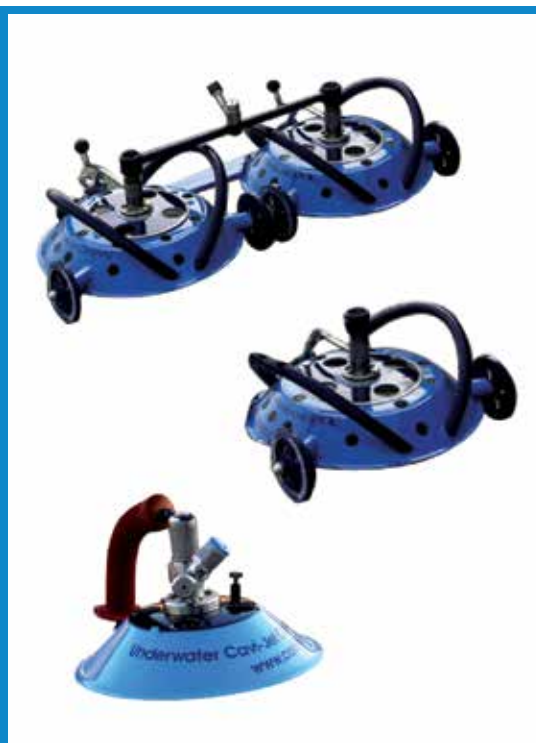
CAVI-JET HEAD UNDERWATER CLEANING / GRINDING / POLISHING