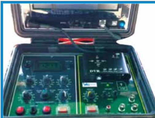
PORTABLE DINING CCTV