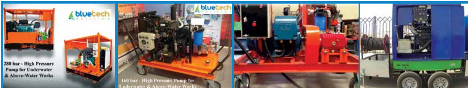
HIGH PRESSURE PUMPS