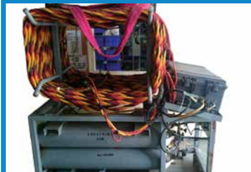
TOW DIVERS SURFACE SUPPLY DIVING UNITE – SRP001